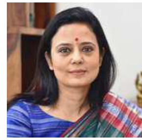
TMC MP Mahua Moitra

who voted for the panel is Preet Kaur, suspended Congress leader and wife of former Punjab Chief Minister Captain Amarinder Singh who has joined the BJP. The panel's draft report is said to have found Moitra's conduct "highly objectionable", "unethical", and "heinous".